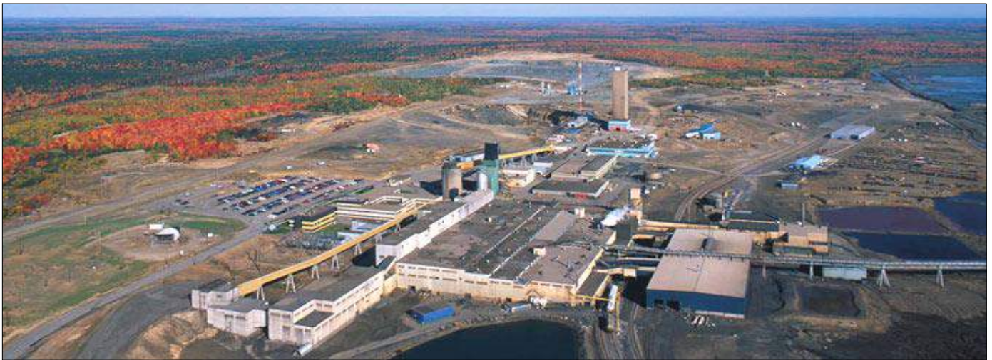
The Brunswick Number 12 deposit contained nearly 295 million tons of massive sulphides and is currently operating on 10,000 tons per day

The Company entered into an option agreement with Xstrata Zinc Canada ("Xstrata") to explore the Bathurst Mining Camp in New Brunswick and acquire a 50% interest. The Company has vested its 50% interest in the related mineral claims held by Xstrata by advancing the required $5.0 million.